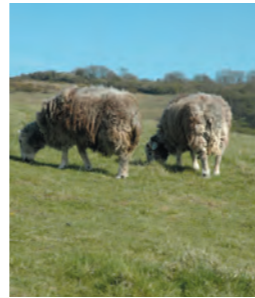
South Downs sheep

the South Downs, and now it is only 3%. It is dependent on appropriate grazing, or it becomes taken over by coarse grasses and shrubs. These shade out the light that the delicate chalk grassland needs.