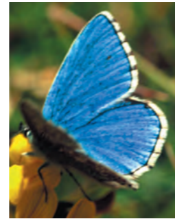
Adonis blue butterfly

Chalk grassland occurs where soils are very thin, well drained, nutrient poor and overlay chalk bedrock. It is characterised by a mixture of grasses and wildflowers, in particular herbs, with a few shrubs and trees. This supports many animals including butterflies such as the Adonis blue and silver-spotted skipper, and birds such as skylarks and corn buntings.